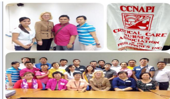
CCNAPI's Advanced Practice Nursing Meeting in Manila Philippines.