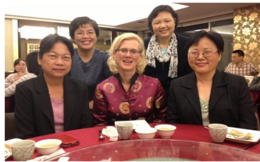
Officers of the Taiwan Critical Care Nurses & Taiwan Association of Nurses