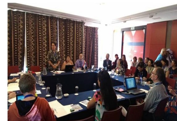
WFCCN Business Meeting in Durban