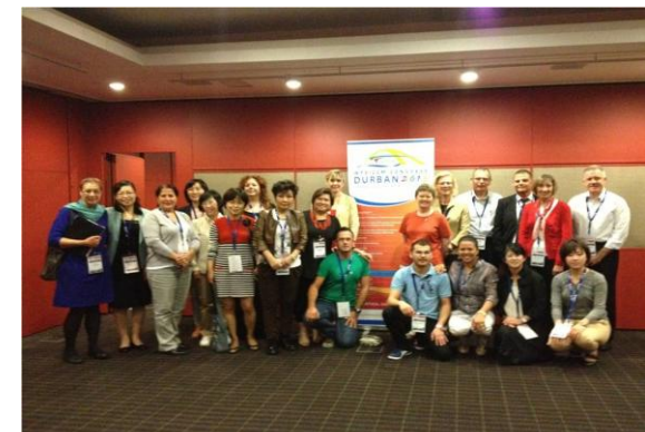
WFCCN Country Member Representatives At Durban World Congress