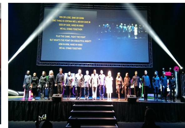
Durban Congress Opening Session