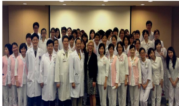
Tri-Service General Hospital